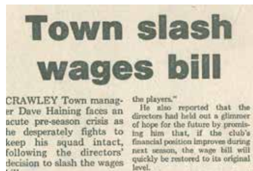
1970s - Total budget cut to £80 a week!

'In fact the reduced budget analogy works very well for my first featured game. Before introducing the match I have included an article on budget cuts written during Dave Haining's managerial reign in the mid-1970s