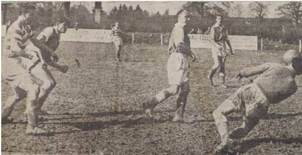
April 26th 1958 - Crawley 4 BHA 0 - Randall scores