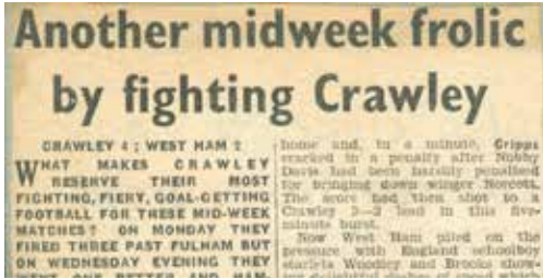
April 16th 1958 Crawley 4 West Ham United 'A' 2

As an example, the game after the 4-2 victory we lost 5-0 to Dunstable!