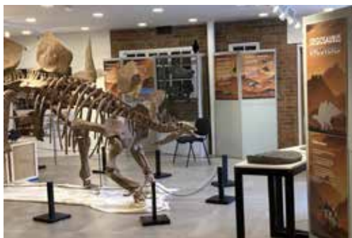
Stegosaurus waiting for the crowds