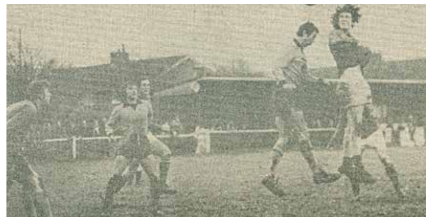
January 6th 1977 We beat star studded Barnet 3-2 - Mulhearn scores header