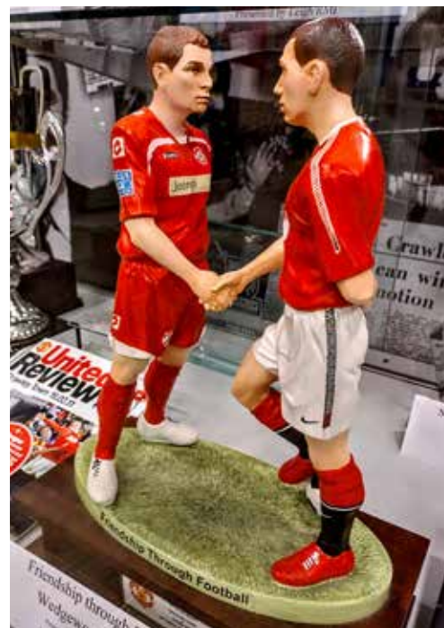
Statuette from the Man Utd FA Cup game at Old Trafford in Feb 2011